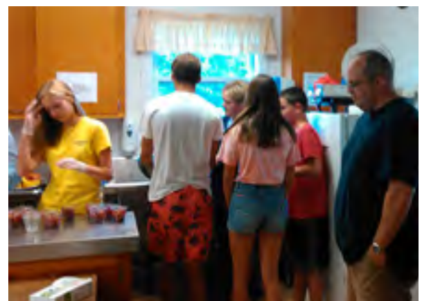
Our youth prepare a mid-day snack